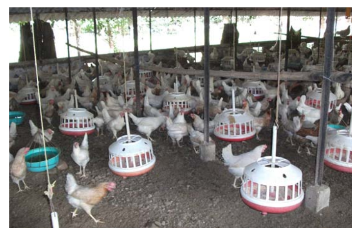
Laying hens are kept in open, well-ventilated barns, provided with rice husk bedding and perches. The housing density is over 2 sq ft per hen.

The Kuroiler supply chain also created business opportunities for owners of mother units and mobile vendors, who are able to derive a stable source of income from the sale of the Kuroiler. The average monthly scale of operation of mother units was 1,500 chicks, sold between the ages of 15 and 30 days. Before taking up the occupation, the owners of the mother units were either unemployed or worked as agricultural labourers or construction workers. Gross margins varied between Rs.10,000 and 20,000 with net income per month between Rs.3,800 and 5,300. The scale of operation of pheriwallas was between 1,000 and 2,000 chicks a month. Gross margins varied from Rs.2,000 to 10,000, with net income per month ranging between Rs.1,100 to 9,300.